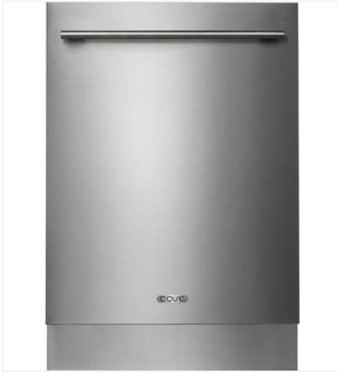
Cove SP-C9009547 Stainless Steel Dishwasher Panel