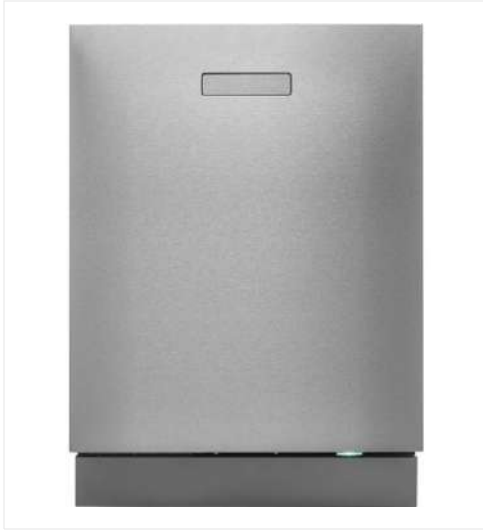
Asko ADBI664IXLS Undercounter 24" Dishwasher; Stainless Steel