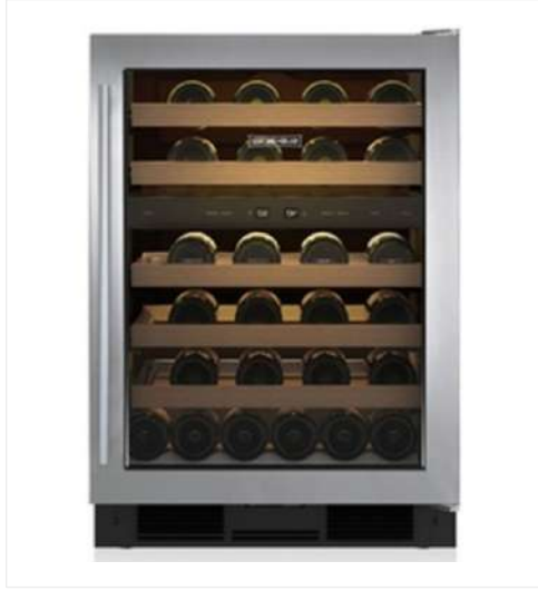
Sub-Zero SUW24STHRH 24" Undercounter Wine Storage; Stainless Steel Glass Door; Right-Hinge Door