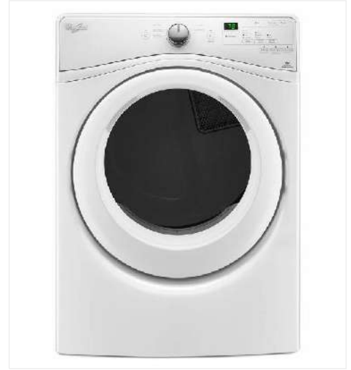
Whirlpool WWED7590FW 7.4 Cu. Ft. Duet Long Vent Front Load Electric Dryer; White; 27" X 39"