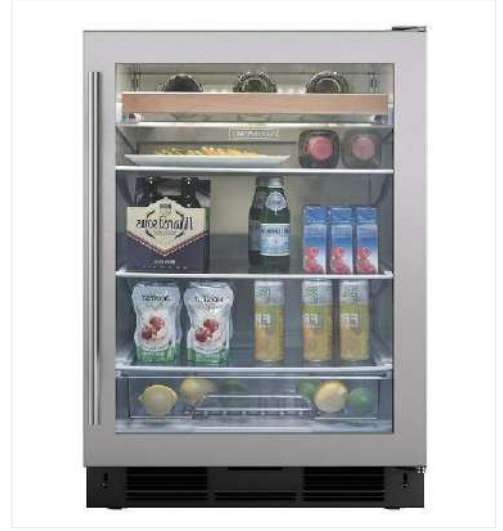
Sub-Zero SUC24BGSTHRH 24" Under-Counter Beverage Center; Stnls Steel; 23-7/8" X 34" X 24"