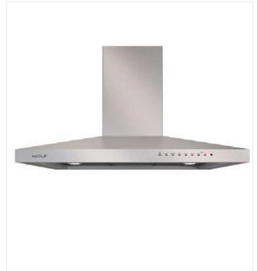
Wolf WW36S 36" Cooktop Wall-Hood; Stainless Steel