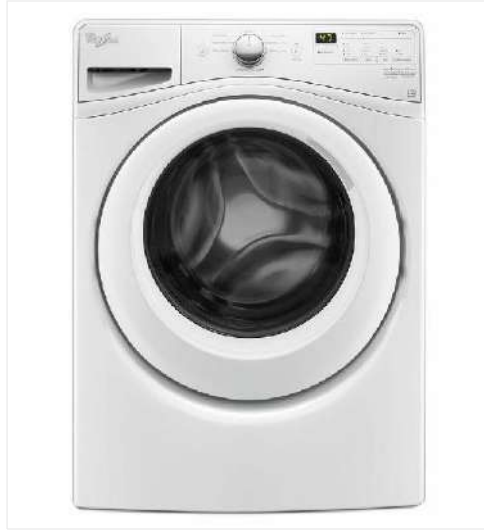
Whirlpool WWFW7590FW 4.2 Cu. Ft. Front Load Washer W/ Closet-Depth Fit; White; 27" X 39-3/4"