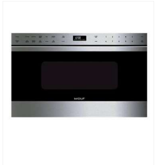
Wolf WMD24TES 24" Microwave Drawer ; Stainless Steel; 1.2 CF; 950 Watts