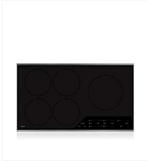
Wolf WCI365TS 36" Transitional Induction Cooktop; Stainless Steel Trim; Black Ceramic Glass