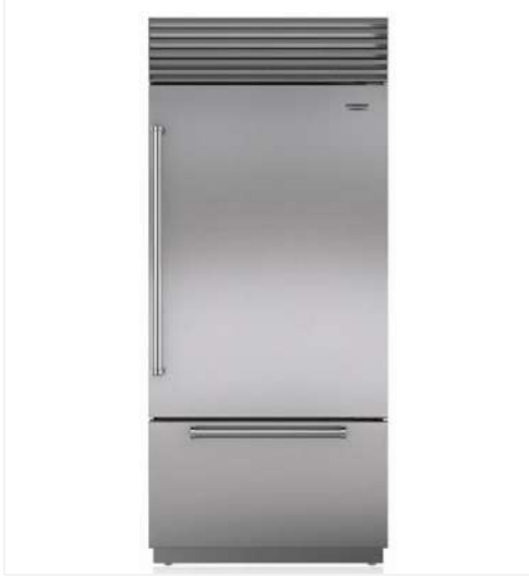
Sub-Zero SBI36UIDSTHRH Built-In Over And Under Refrigerator W/ Internal Dispenser; Stainless Steel; 36" X 84"; Right-Hinge Door