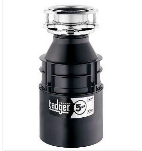
In-Sink-Erator IBADGER5XP Food Waste Disposer; 3/4HP Motor; On/Off Wall Switch; Galvanized Steel Construction; Space-Saving Compact Design