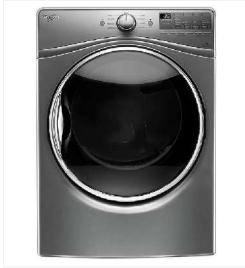
Whirlpool WWED92HEFC 7.4 Cu. Ft. Electric Dryer W/ Advanced Moisture Sensing; Chrome Shadow; 27" X 39"