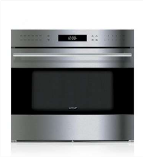
Wolf WSO30TESTH E Series 30" Single Electric Wall Oven ; Stainless Steel; 4.5 CF