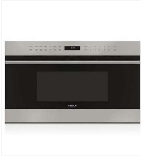
Sub-Zero WMDD30TESTH E Series Transitional Drop-Down Door Microwave Oven; Stainless Steel; 29-7/8" X 20"