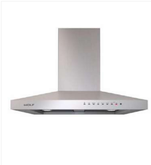
Wolf WVW30S 30" Cooktop Wallhood; Stainless Steel