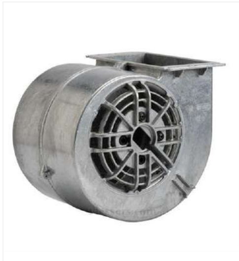
WOLFRANGE W822726 *CVR* BLWR VENTILATION 300 CFM