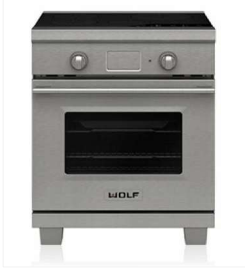
Wolf WIR304TESTH 30" Transitional Induction Range; Stainless Steel