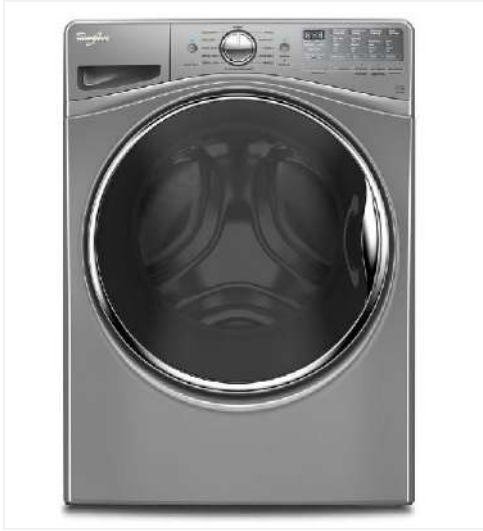
WHIRLPOOL WWFW92HEFC 4.5 CF Front Load Washer