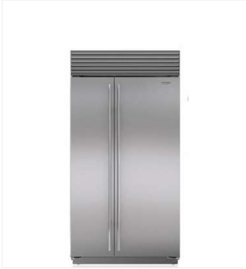
Sub-Zero SBI42SIDSTH 42" Built-In Side-By-Side; Stnls Steel; 42" X 84" X 24"