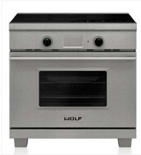
Wolf WIR365TESTH 36" Transitional Induction Range; Stainless Steel