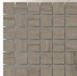
Mosaic (Moka shown)